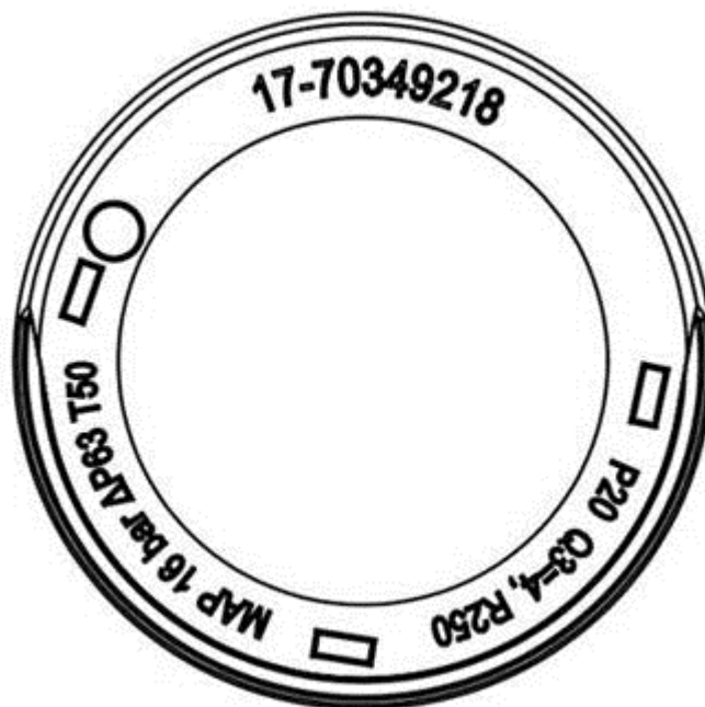
Alternative marking arrangements – dial plate and meter casing